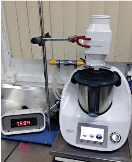
Figure 1 – Process simulator (Thermomix® TM5)

HUILIYUAN, Xiamen, China). The process simulator can be visualized in Figure 1.